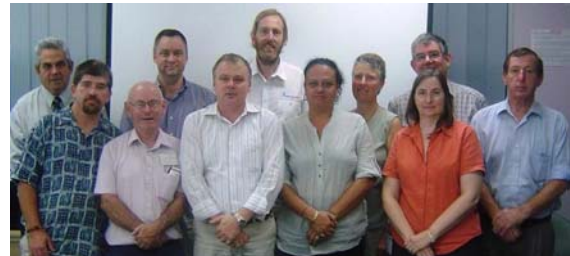
Bidjigal Reserve Trust Board Members

were held on the 25 March and 29 April. A summary of the major decision taken by the Board is included later in this newsletter